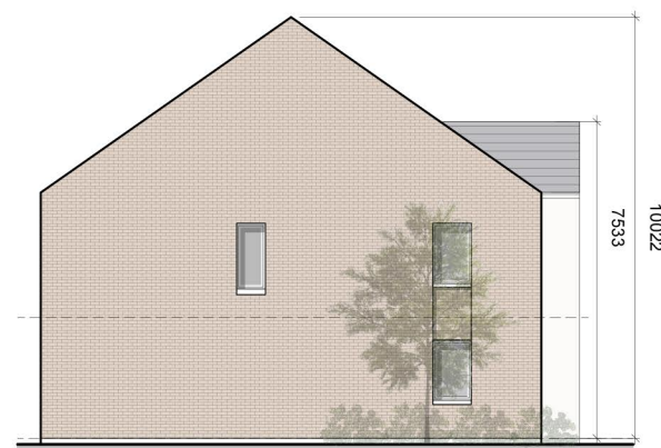
GABLE ELEVATION 1:200