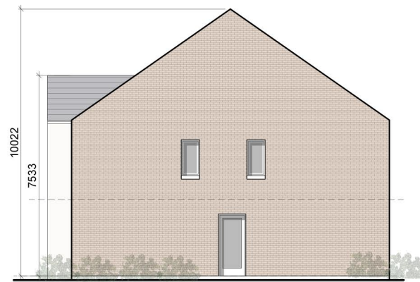
GABLE ELEVATION 1:200